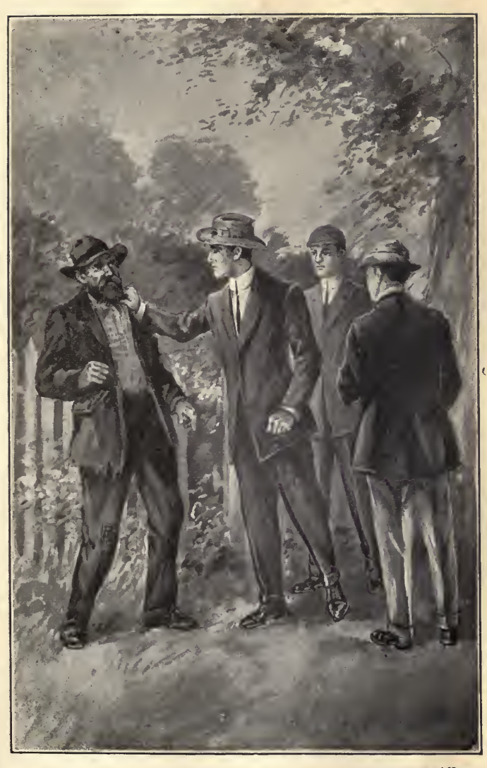
"YOU'LL TELL ALL YOU KNOW WITHOUT THE DOLLAR!" CRIED DICK.—Page 186. The Rover Boys Down East.